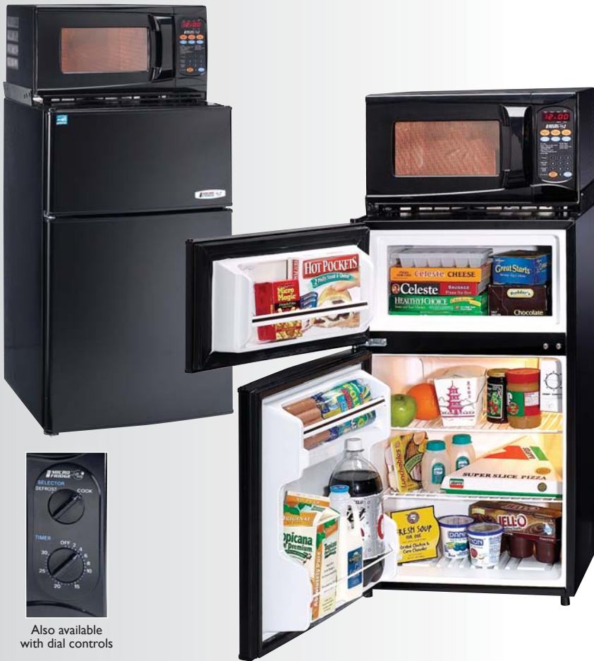
Also available with dial controls

Engineered for value. Designed for life.